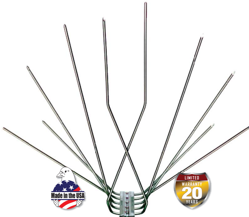
Image shows the 5 wires per inch, gap free coverage. (Shown 20% larger than actual size)